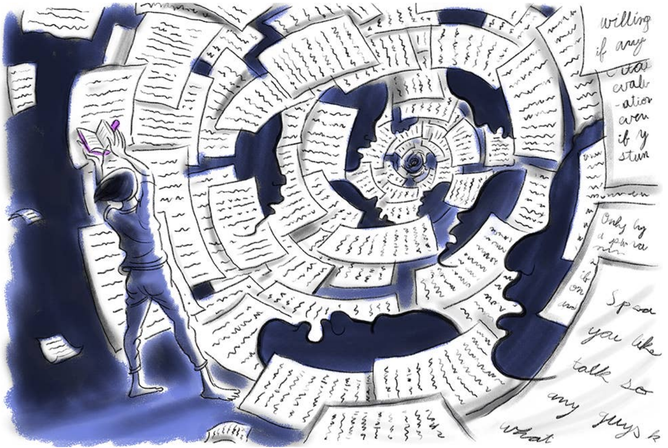
Will Varner / BuzzFeed